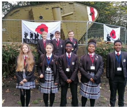
Fig 3: Cedars Park Remembrance Day group

Whilst the school were paying their respects on Remembrance Day, a small group went to Cedars Park Memorial service and laid a wreath as part of the service organised by the Park. We had some excellent comments about their behaviour and a great deal of appreciation that the 'younger generation' were involved in the Remembrance Service.