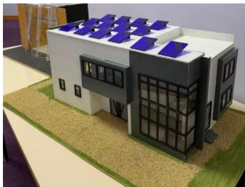
Fig 4: Y12 Architectural Design