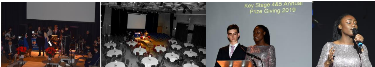
Fig1: KS4 and KS5 Prizegiving