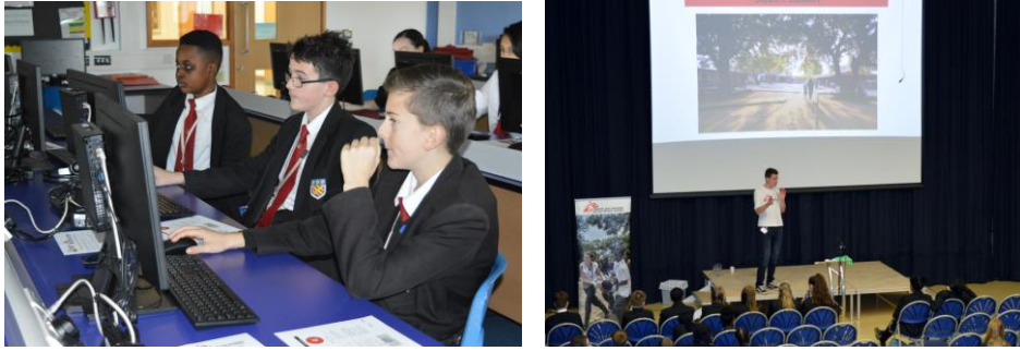
Fig 2: MSF presentation and workshop

Whilst the school were paying their respects on Remembrance Day, a small group went to Cedars Park Memorial service and laid a wreath as part of the service organised by the Park. We had some excellent comments about their behaviour and a great deal of appreciation that the 'younger generation' were involved in the Remembrance Service.