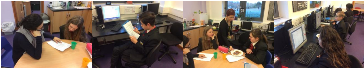
Fig 8: students working in the Student Centre

It's a great way to start your morning, you get toast, you get juice, you get help. K yr 9