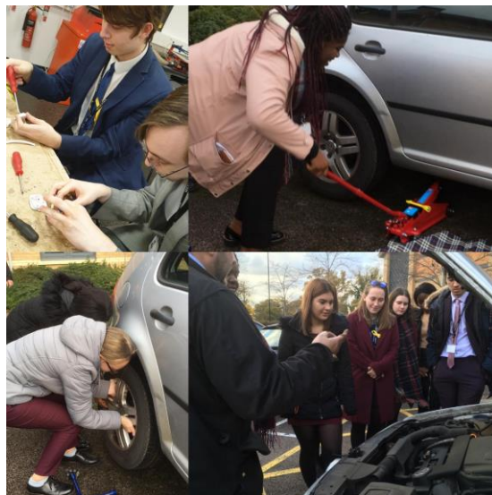
Fig 6: 6 th Form Enrichment

This half term the Sixth form students have had the opportunity to take part in a series of Enrichment Workshops. Students have had the chance to experience life skills they may need in the future. They have had a broad spectrum to sign up for; Vehicle maintenance, Basic clothes repair, Household maintenance and Life coaching, also coming up we have Financial skills and Flat pack assembly. The students have really enjoyed the new experiences and continue to sign up, vehicle maintenance has proved most successful with our budding new drivers. I would like to thank the technology department for giving up their free time to plan and deliver these valuable workshops.