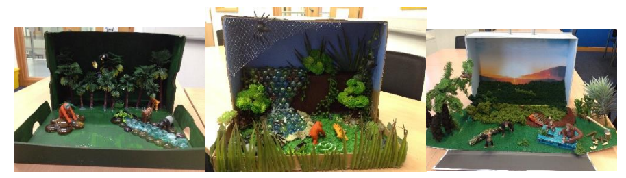
Fig 2: Y7 Geography Models

Back in November our Year 13 Business BTEC students planned and ran a 'Branding Workshop' for a group of Year 7 students. They started with some fun activities, whilst delivering active learning about branding in business. Then the Year 7's were set a challenge to create a logo, slogan and advertising for their new business 'Aloha'. The Year 7 students were very enthusiastic and this showed in the advertising they created.