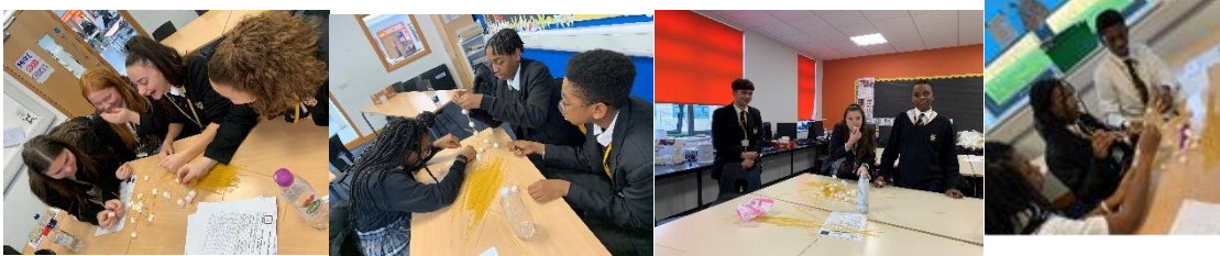
Fig 4: WEX Ability Day