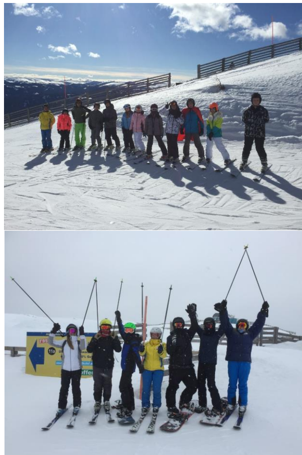
Fig 3 – 2020 Ski Trip

A group of 40 students and five staff spent the week of half term in the Austrian mountains. The group consisted of a large number of first time skiers and boarders plus a few who were more experienced. All students made excellent progress throughout the week with the majority of the first timer skiers making it to the top of the mountain by the end of the week. The group enjoyed excellent weather on the mountains with lots of blue sky skiing and one day skiing in the falling snow all amongst the beautiful back drop of mountains. The students also enjoyed evening activities which included watching a game of ice-hockey in Zell Am See and swimming. The students represented the school incredibly well with the ski school, hotel and coach drivers all commenting on the positive attitude and resilience shown. The accompanying staff commented on how supportive the students were to each other on the slopes and how much fun it was to spend with the group.