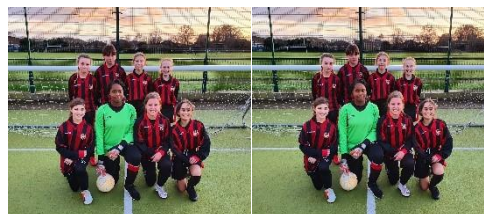
Fi 8: Girls' Football Team