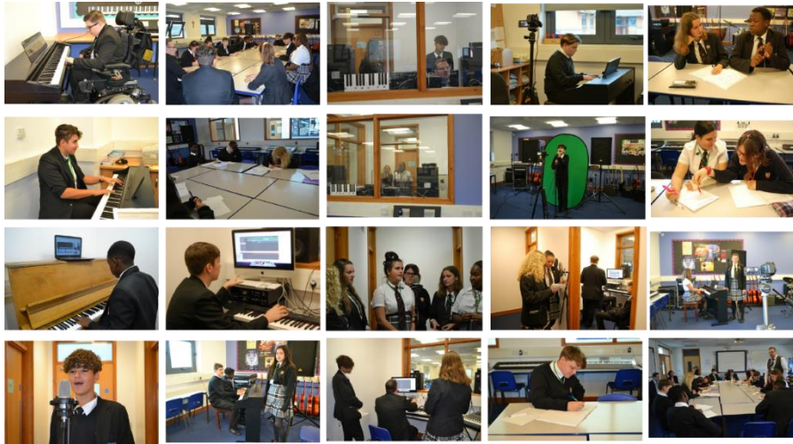
Fig 6: KS4 Music