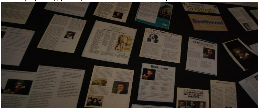
Fig 5: KS3 Music Work

In Performing Arts (Music, specifically) KS3 students have been listening to a wide range of styles as part of the 'do now' tasks including works from the 'Great Composers'. Year 7 have had a spotlight focus on Beethoven leading to some fantastic written reports. Students were asked to listen to and write a review about Beethoven's 5 th Symphony, perhaps the most well-known piece of all time?