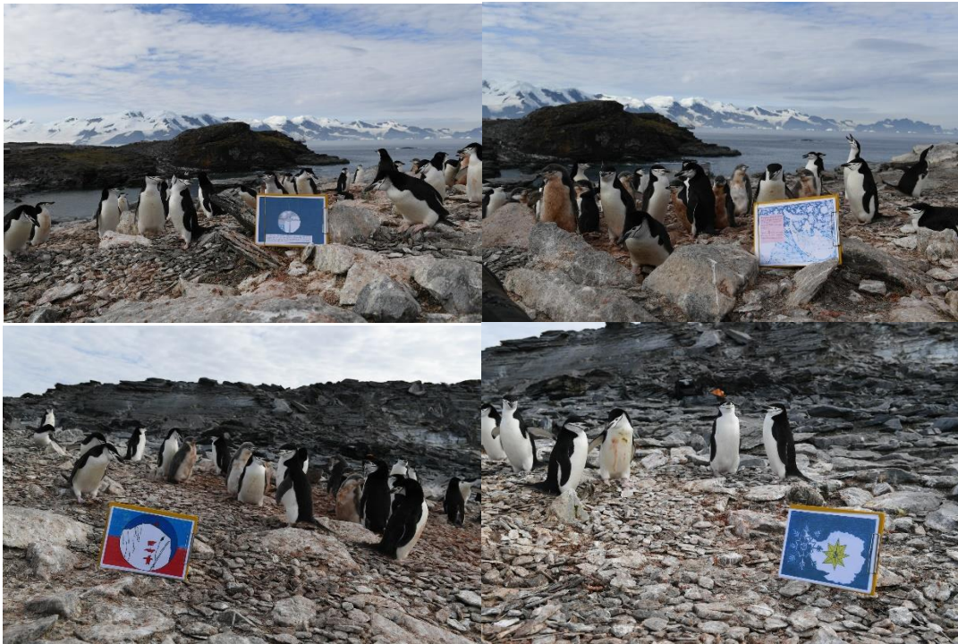
Fig 3: St Mary's students' flags

A few months ago I mentioned that students had designed flags to celebrate Antarctica. The winners were sent off, and this week we received pictures of the flags in situ.