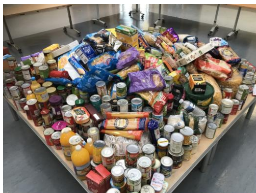
Fig One: Harvest Festival Donations

Thank you for your generosity with the Harvest Festival Collection. We have amassed a large contribution for the Broxbourne Food Bank: