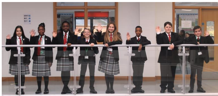
Fig two: Y7 students, and Y7 Student Councillors

During our morning tutorials, students have been completing a unit of work around their book titled "You are Awesome" , written by Matthew Syed. This work develops further the work many students completed over the summer.