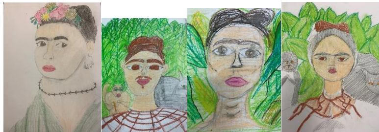
Y7 have completed their portraiture project with a creative transcription inspired by Frida Kahlo (above)