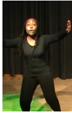
Y11 Drama students