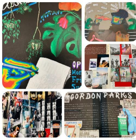
Shaloma Philips in Y11, is producing some excellent 'Daily Life' research and responses (above).