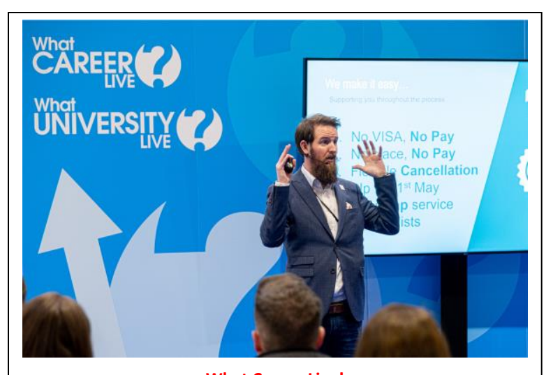
What Career Live! 10<sup>th</sup> & 11<sup>th</sup> November

With so many options to choose from when you leave school or college, it can be hard to know where to start.